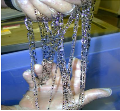
Cane toad eggs