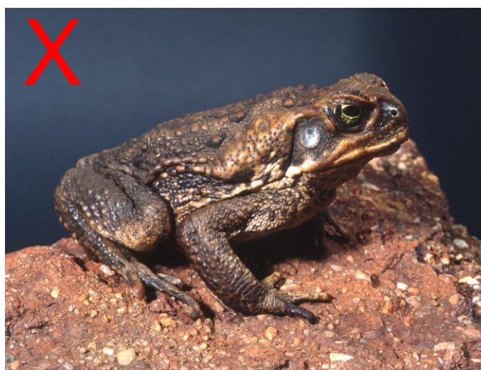
Adult cane toad