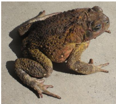
Cane toad found in Adelaide