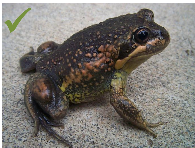
Native banjo frog