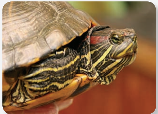
Figure 4. Red-eared Sliders pull their heads straight back into their shells if threatened.