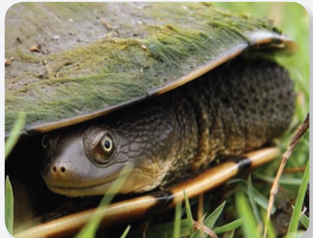
Figure 3. Native turtles fold their necks sideways into their shells if threatened (photo: Tarnya Cox Photography).

neck sideways into the shell (Figure 3), whereas the Red-eared Slider retracts its head by pulling it straight back into the shell (Figure 4).