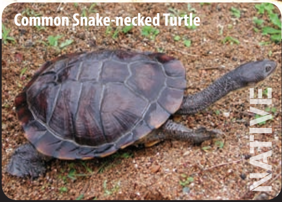
Common Snake-necked Turtle