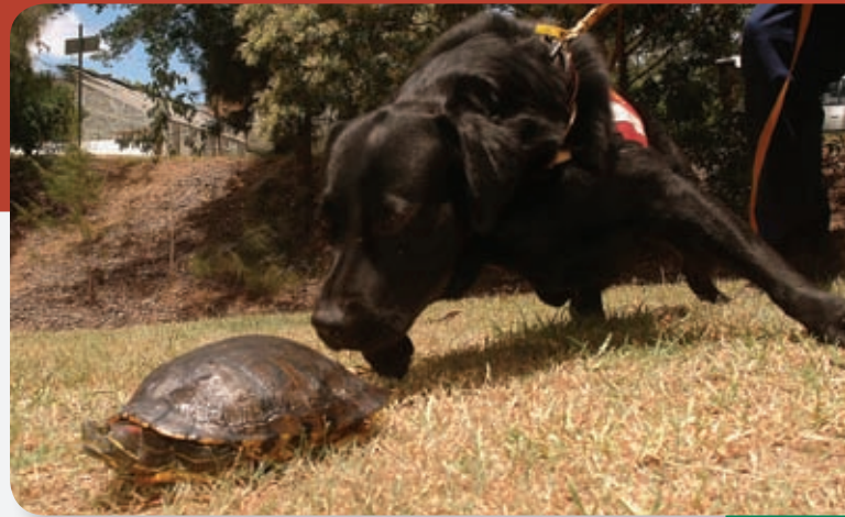
Figure 6. Surveillance activities are carried out in some areas to locate sliders in the wild. Angus the sniffer dog has been trained to locate sliders and their buried eggs.

The Chief Executive Officer of the Department of Agriculture and Food and the State of Western Australia accept no liability whatsoever by reason of negligence or otherwise arising from the use or release of this information or any part of it.