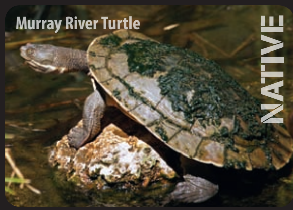
Murray River Turtle