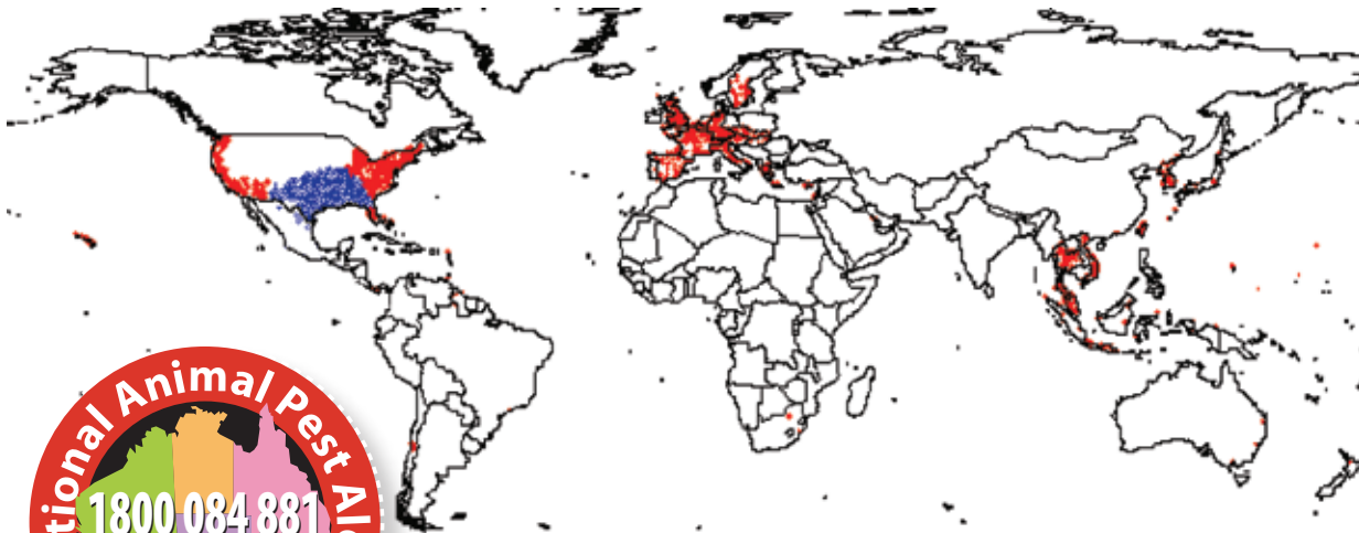
Figure 1. The distribution of the Red-eared Slider including natural (blue) and introduced (red) populations.