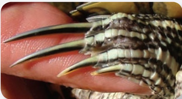
Figure 2. Male Red-eared Sliders have long claws on their front feet.

Some Australian freshwater turtles can be mistaken for sliders, but there are some important differences. Slider carapaces are dome-shaped whereas those of native turtles are fairly flat. In addition, native turtles do not have the long claws typical of male Red-eared Sliders (Figure 2). When threatened, a native turtle retracts its head by folding its