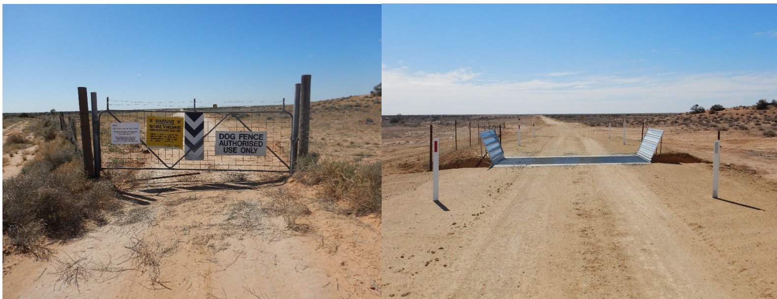
Muloorina Pipeline Road (south) gate replacement before & after