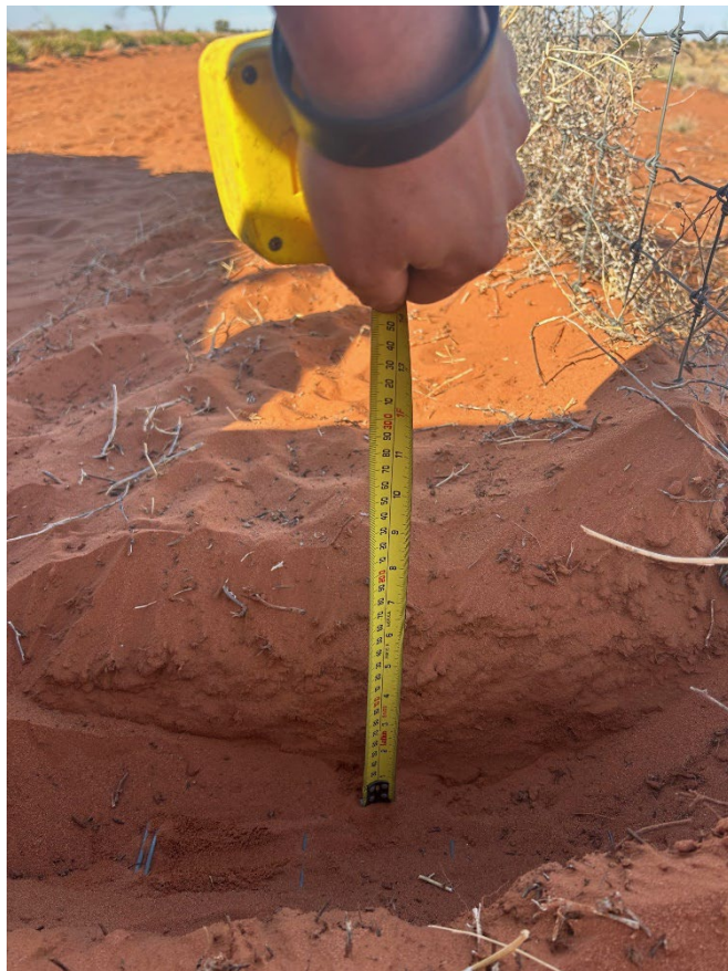
20 – 30cm sand build up – Billeroo (Frome LDFB)