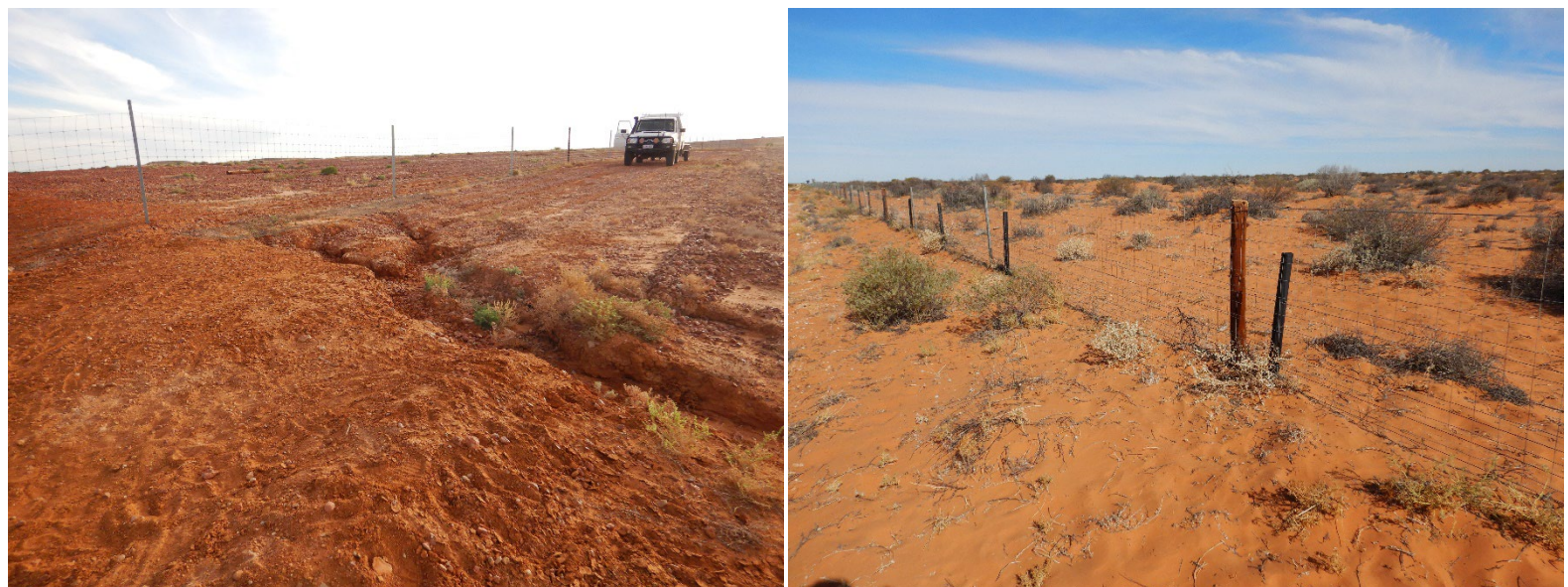
Water erosion and sand build up – Muloorina (Marree LDFB)