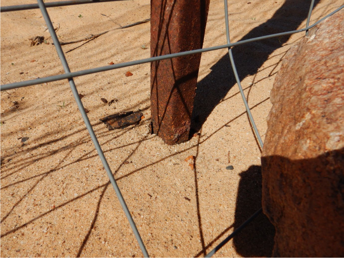
Rusted posts around Lake Eyre South (5km section)