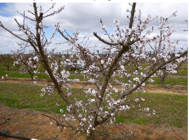
Bloom of RiverCot 8 September 2017