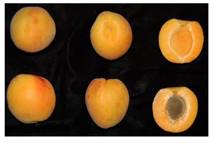
Fresh fruit of tree ripe RiverCot 8.