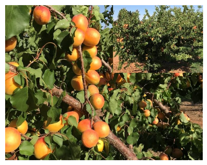
Fresh fruit of RiverCot 8 on young trees December 2017

All data presented in this guide refers to trees grown at the Loxton Research Centre (LRC) on Myrobalan H29C plum rootstock, unless specifically stated. Performance on other rootstocks is untested.