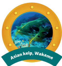
Asian kelp, Wakame