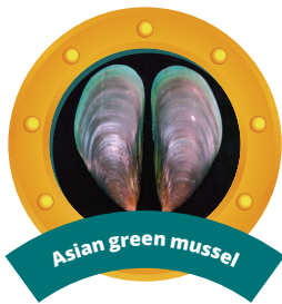
Asian green mussel