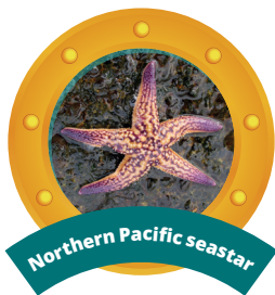
Northern Pacific seastar