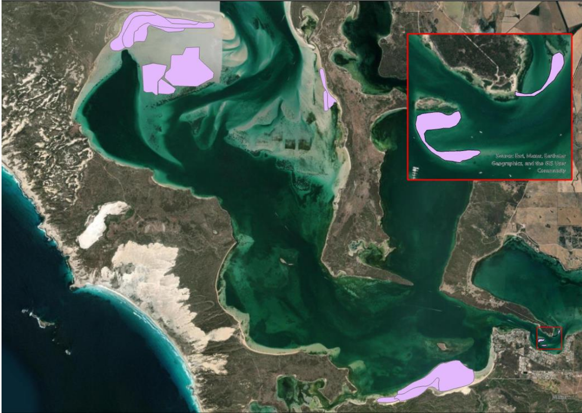
Figure A1. Sampling areas (strata) for Coffin Bay Fishing Zone in 2023 (n=284 transects). Locations are Longnose Point (top left), Oyster Farms (second from top left), Little Douglas (top centre) and Long Beach (bottom right). Inset shows two additional strata in Kellidie Bay containing four transects (Total number Including Kellidie Bay = 288 transects)