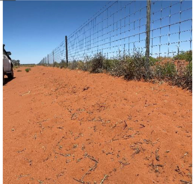
C: Erudina – January 2025