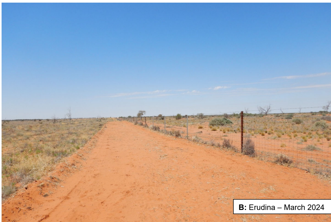
B: Erudina – March 2024