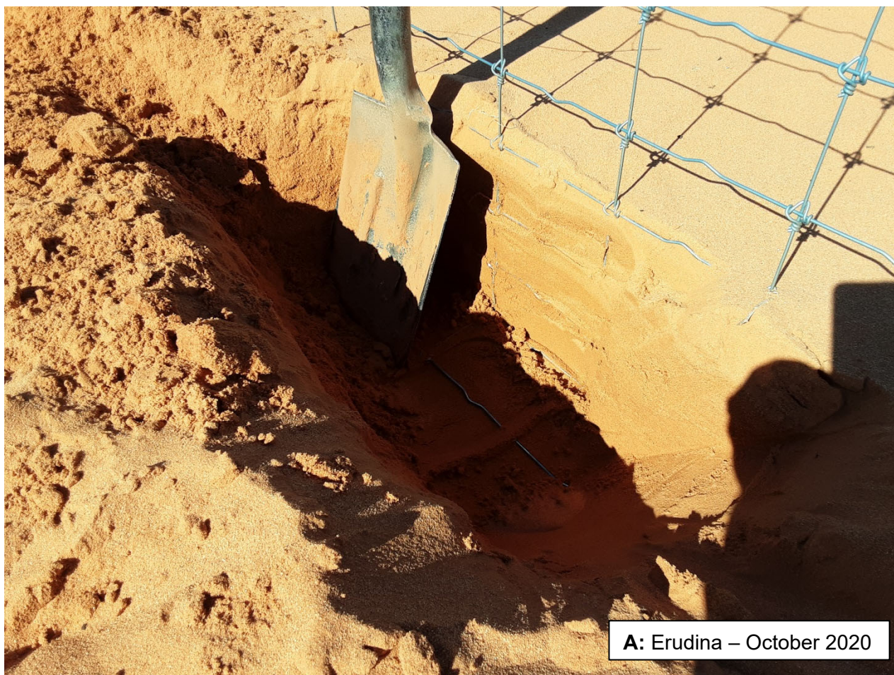
A: Erudina – October 2020