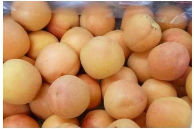
RiverCot 1 sensory panel fresh fruit 2017/18

This is an excellent apricot for both fresh market and drying uses.