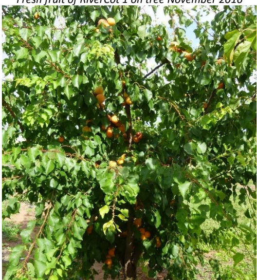
Fresh fruit of RiverCot 1 on young trees November 2017

The purpose of this Grower Information Guide is to provide information to help growers make an informed decision on the planting of this apricot variety.