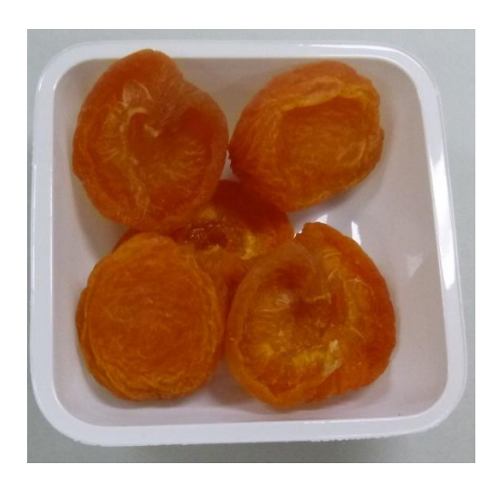
Dried halves of RiverCot 1 2016

The Tree: RiverCot 1 is a vigorous, moderately spreading, spur bearing tree. It benefits from an increase in the number of leaders (5-6) to better fill space, spread vigour and control extension when grown in "free standing V" type systems. It appears well suited to pedestrian orchards planted at 4.5m by 2.5m spacing. While the frame of the tree is relatively upright, extension growth behind the terminal bud is often weeping giving the tree an unruly appearance, although it is quite easy to train and build fruiting structure. Trees should be kept open to help condition fruit and prevent pale shoulders.