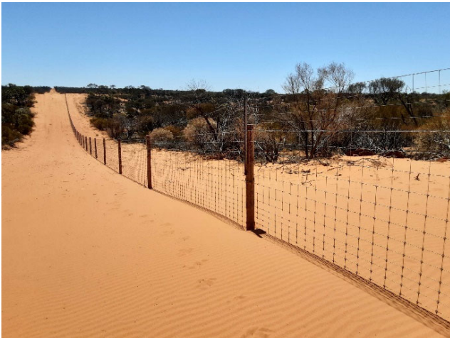
Image 7 - Fence heightening at Lake Everard due to sand drift