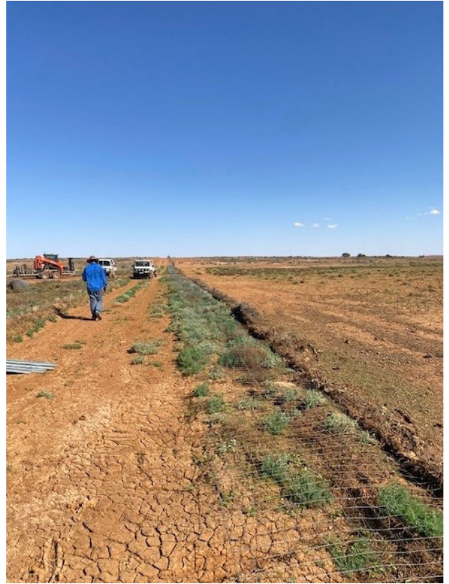
Image 2 - Flood repairs at Mundowdna