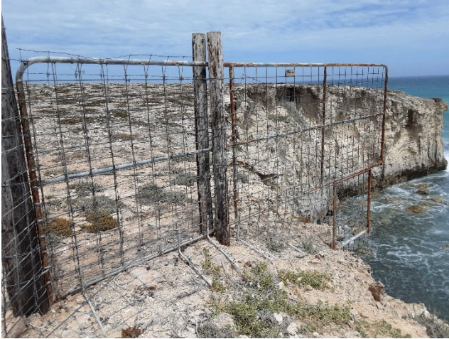
Image 5 - Gate over the cliff at the western end of the fence