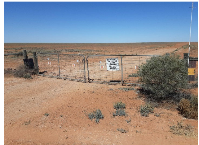
Image 4 - Double gates on the pipeline road