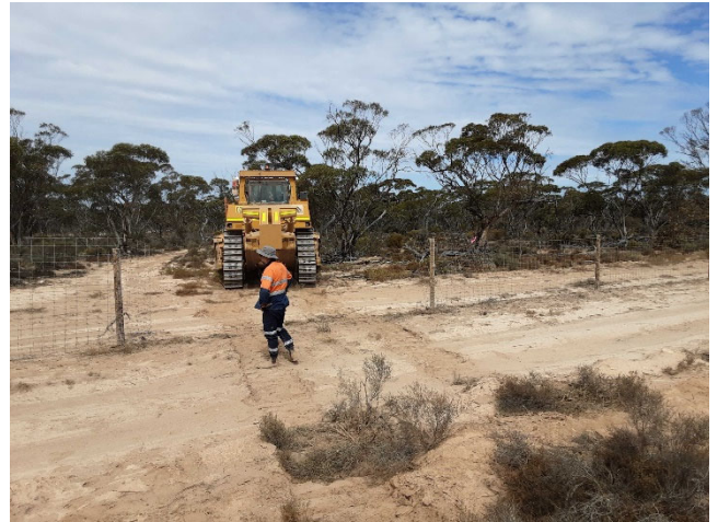
Image 6 - Telstra working through the new fence