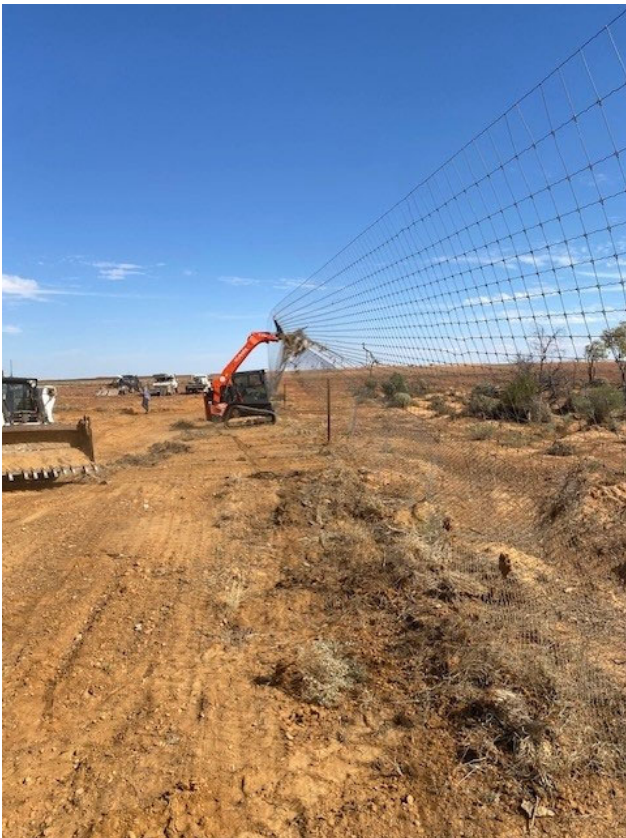
Image 3 - Flood repairs at Mundowdna