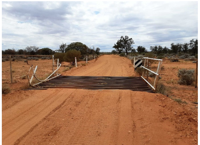
Image 8 - Grid at Mulgathing