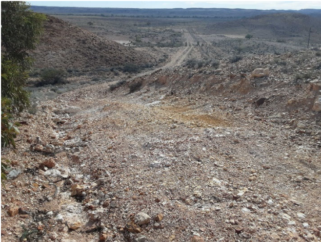
Image 1 - Rough access track at Mulgaria