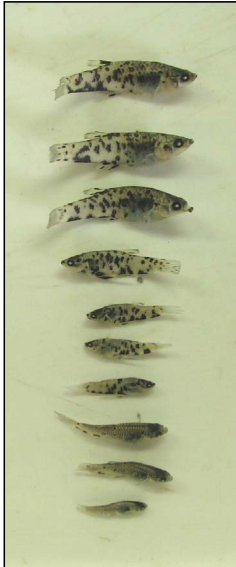
Figure 4. Specimens used for the taxonomic identification of livebearers from Willunga Creek. Note the variation in pigmentation, size and morphology between individuals.

All ten individuals of the target species keyed out for taxonomic identification were clearly classified as Phalloceros caudimaculatus (Hensel, 1868). All of the fish had black blotches and all of the males (n=4) had a hooked gonopodium that were longer than their heads (Figure 4). Gambusia affinis and G. holbrooki never have hooked gonopodium (Lloyd 1990). Dorsal and fin ray counts were either 8 or 9 for all specimens, fitting within the description for P. caudimaculatus (Lucinda 2008). Alternatively, G. affinis possess 6 dorsal rays (McDowall 1999) and G. holbrooki 7 dorsal rays (Lloyd and Tomasov 1985, Lloyd 1990). Additionally, G. affinis has more than 12 pectoral rays whilst all of our specimens possessed either 8 or 9. The individual characteristics used for classification are presented in Table 2.