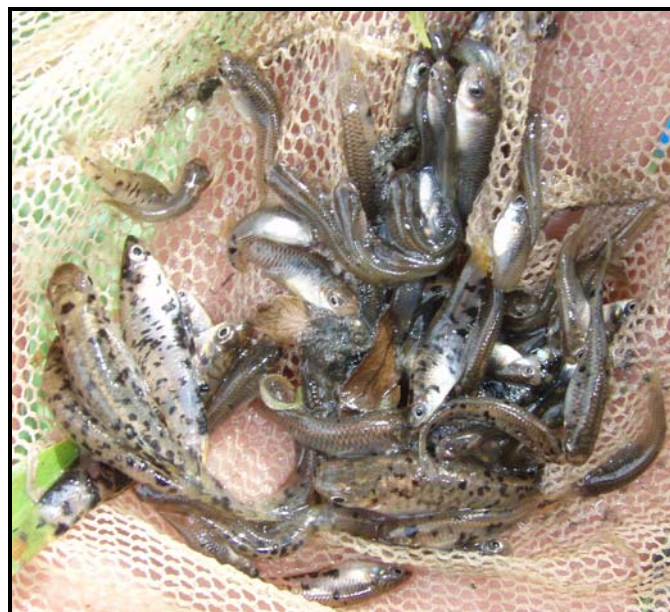
Figure 5. Typical catch of Phalloceros caudimaculatus from a box trap at Willunga Creek.

A total of 1,009 fish were captured from all sites in Willunga Creek using fyke nets and box traps. Of these 1,009 fish, 99.5% of the total catch (TC) was P. caudimaculatus ; the remainder 0.5 % (TC) was G. holbrooki . The only species of fish caught using fyke nets and box traps was P. caudimaculatus (Figure 5) at sites 5-9. P. caudimaculatus was absent from sites 10 and 11. At site 10, the vineyard dam, only five G. holbrooki were captured making up 100% of the total catch at that site.