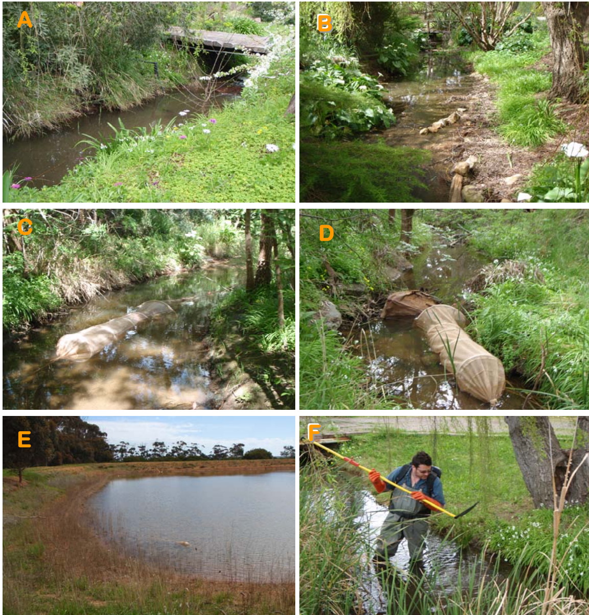
Figure 3. Survey sites a) Giles Road, b) Methodist Street, c) Peacock farm in Willunga, d) Vineyard downstream of the peacock farm, e) Potter's Clay vineyard dam and f) electrofishing on Giles Road. Note that a, b and c all had very strong populations of Phalloceros caudimaculatus , and in site d and site e P. caudimaculatus were absent.

To determine the abundance of P. caudimaculatus in Willunga Creek small fyke nets (wing length 3 m, mesh size 3 mm) and unbaited box traps were set at 6 different sites (Site No. 5-10, Table 1, Figure 2) along the creek on the 18 th of September 2008 (Figure 3). Additionally, surrounding waterbodies and adjoining creeks were surveyed using backpack electrofishing.