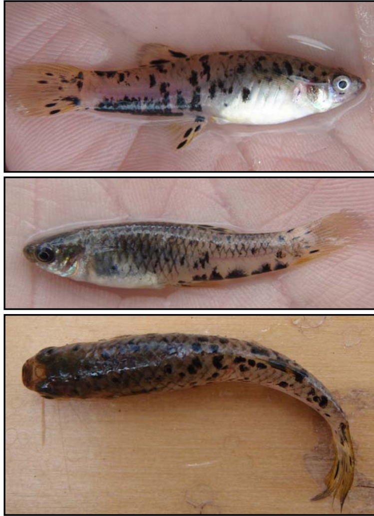
Figure 1. The speckled livebearer, Phalloceros caudimaculatus (Hensel, 1868), from Willunga Creek in Willunga.

In 1963 P. caudimaculatus was permitted import into Australia for the aquarium trade, however, in 1998, due to information on their biology, behaviour, or capacity to become feral in other countries, importation was no longer permitted (McKay 1984). Six species of poeciliid have established non-indigenous populations in Australia, primarily due transportation around the world by the aquarium trade. To date only one of these species, G. holbrooki , is widespread and abundant in Australia. P. caudimaculatus has one of the most restricted distributions of the six species of Poeciliidae in Australia (Rowley et al. 2005).