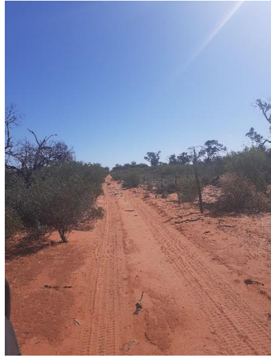
Vegetation in Fence and vegetation starting to encroach on the maintenance track