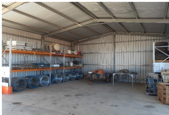
Lyndhurst Depot with new racking installed