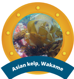
Asian kelp, Wakame

Marine pests are plants and animals which aren't native to Australia. They include crabs, mussels, sea stars, worms and algae. Marine pests can damage port and international shipping structures, impact on our marine environment and potentially affect human health.