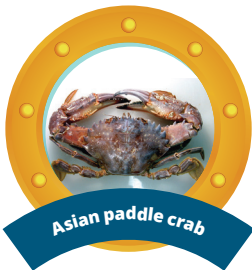
Asian paddle crab