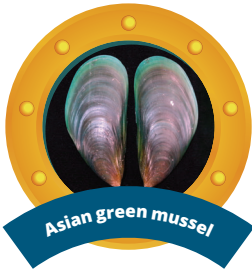
Asian green mussel