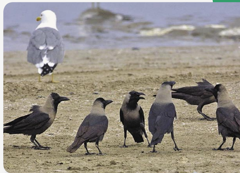
Figure 5. House Crows from an introduced population in Barka, Oman.

Many control programs overseas have attempted to eradicate the House Crow or lessen the damage it causes. Methods used include shooting and scaring with firearms, trapping, chemical repellents, poison baits and habitat modification. Other methods include destruction of nests and paid-bounties on crow eggs and chicks.