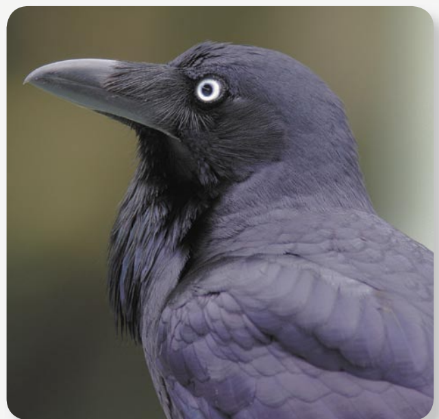
Figure 2. Adult Australian Raven.

Introduced populations also occur in Malaysia, Singapore, Hong Kong and the Netherlands.