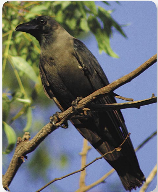
Figure 6. House Crow found in a Port Hedland caravan park (north-western Western Australia) (photo: Greg Ratajczak).

To help prevent the House Crow from establishing in the wild and becoming a pest in Australia, it is essential to immediately report all sightings to the nearest relevant government department or wildlife authority. Any House Crow reported can then be removed humanely.