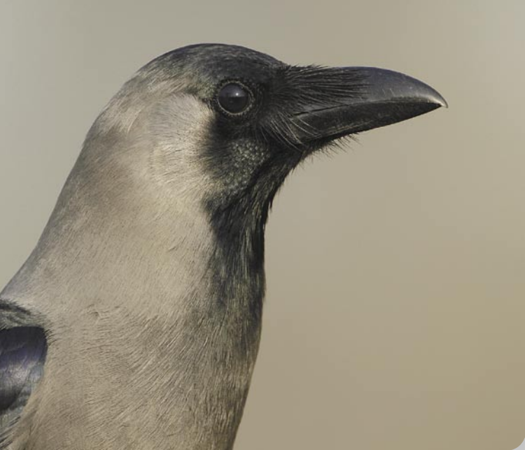
Figure 3. House Crow from Bangalore, India; note the pale neck contrasting with the darker forehead, crown, throat and wings.