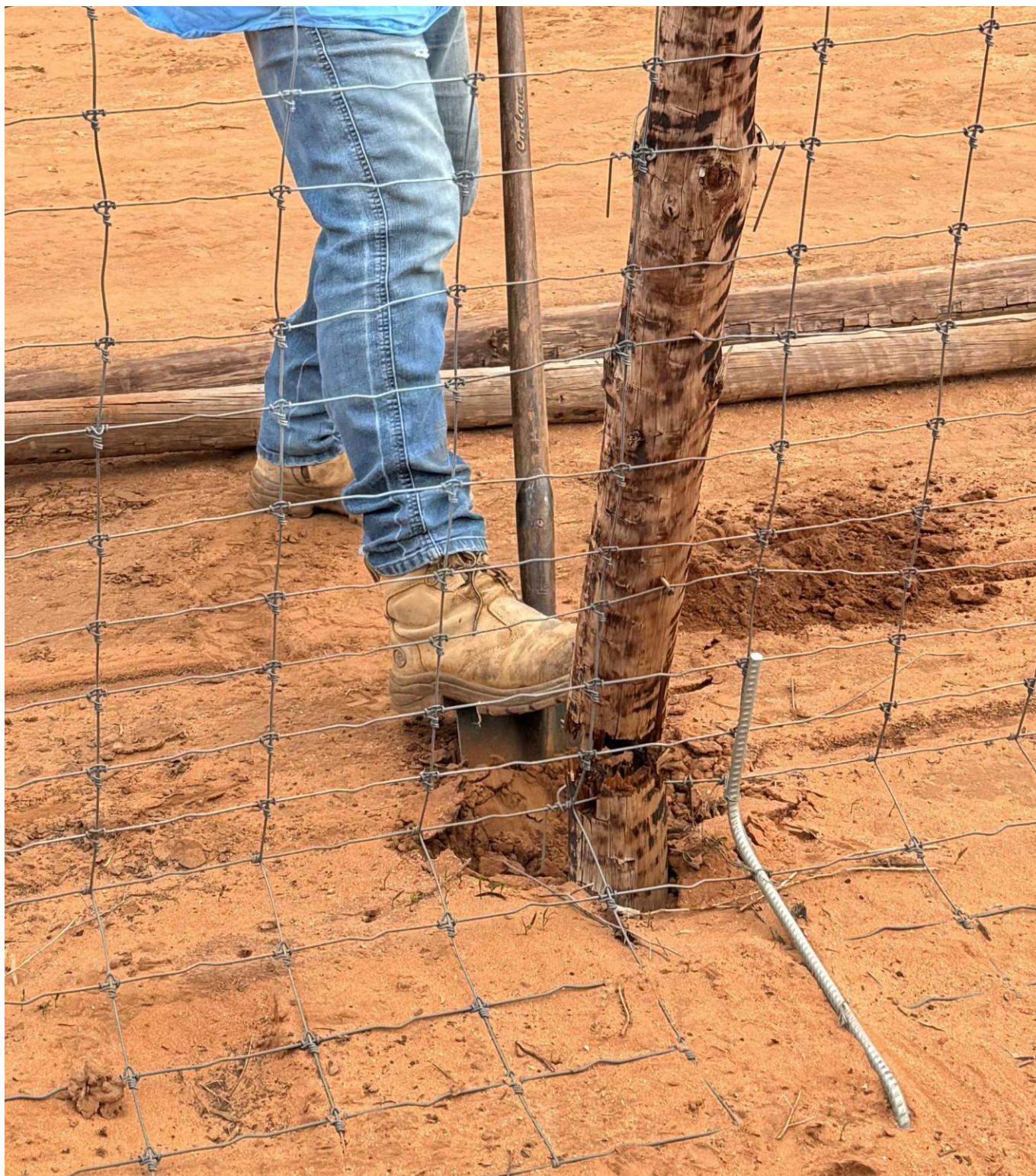
Broken pine post caused by camel pressure – Lake Everard (Penong LDFB)