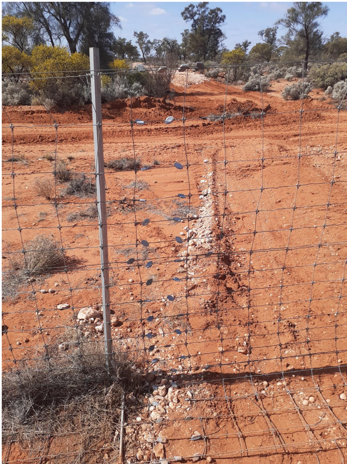
Insufficient repairs made by telecommunication contractors – Malbooma (NW Private)