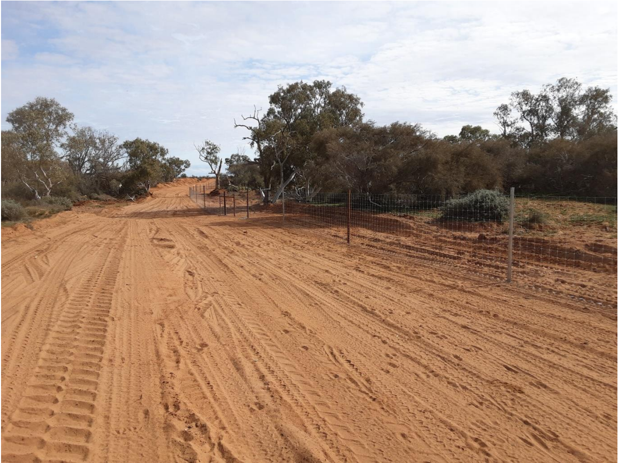
Floodgate replacement - Pootana Creek (Frome LDFB)