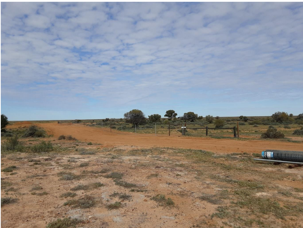
Floodgate replacement – Fossils Creek (Frome LDFB)