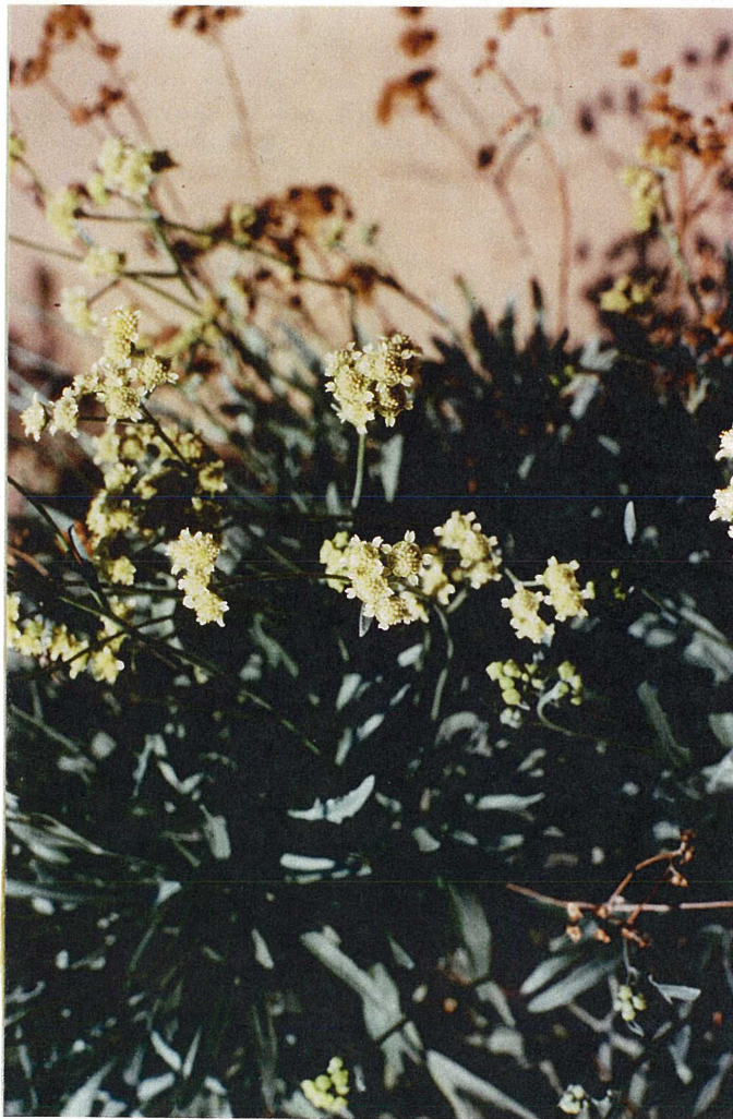
A close-up of guayule flower heads.