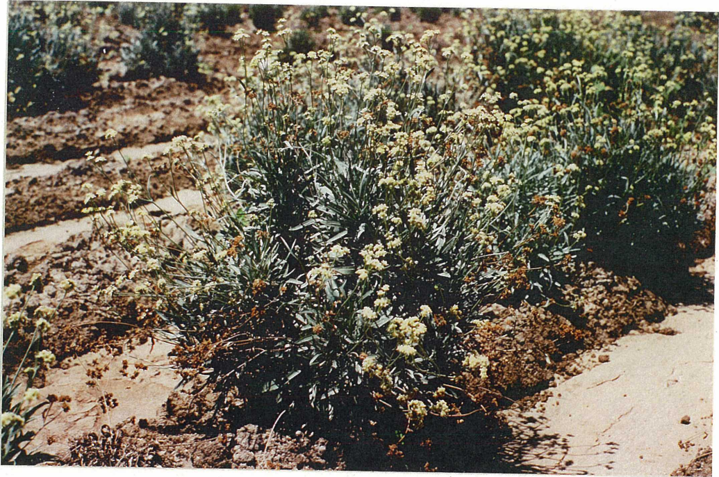
A ten month old guayule plant (approximately 75 cm high) growing under irrigation at Bakersfield, California, U.S.A.