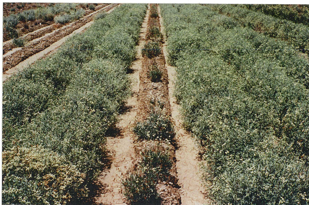
The centre row of native guayule is suffering from various diseases on relatively heavy soils and under irrigation compared with the surrounding hybrid with Parthenium stramonium .

McFarland Research Station, Bakersfield, California.