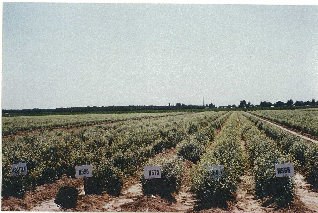
Guayule variety trials at the Schafter Research Station, Bakersfield, California.