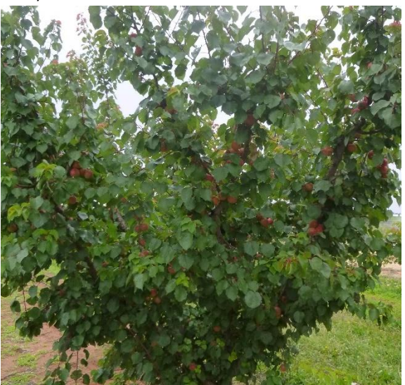
Tree of TastiCot 3 December 2017

All data presented in this guide refers to trees grown at the Loxton Research Centre (LRC) on Myrobalan H29C plum rootstock, unless specifically stated. Performance on other rootstocks is untested.