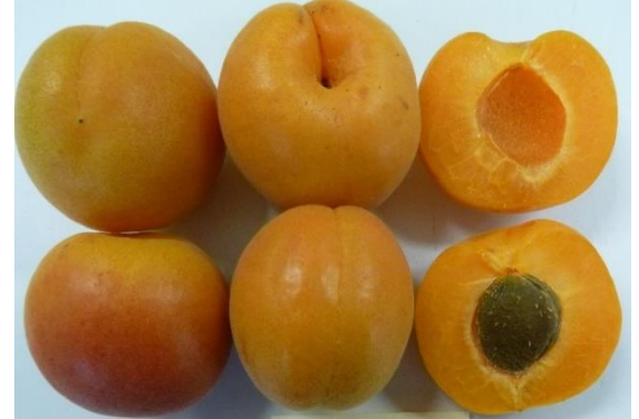
Fresh fruit of tree ripe TastiCot 3.