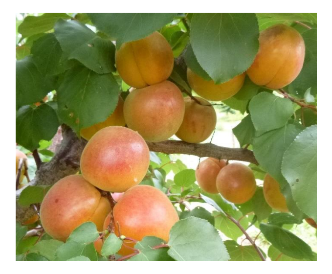
Immature fresh fruit of TastiCot 3 on young trees December 2018