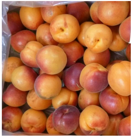
TastiCot 3 sensory panel fresh fruit 2017/18

This is an outstanding fresh market apricot that will dry as an alternative end use.