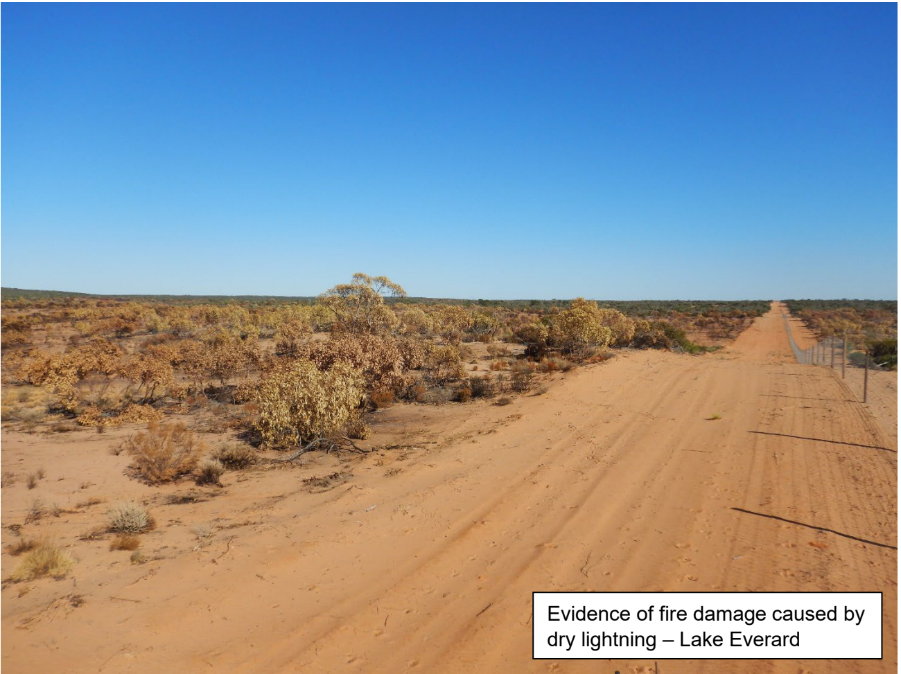
Evidence of fire damage caused by dry lightning – Lake Everard