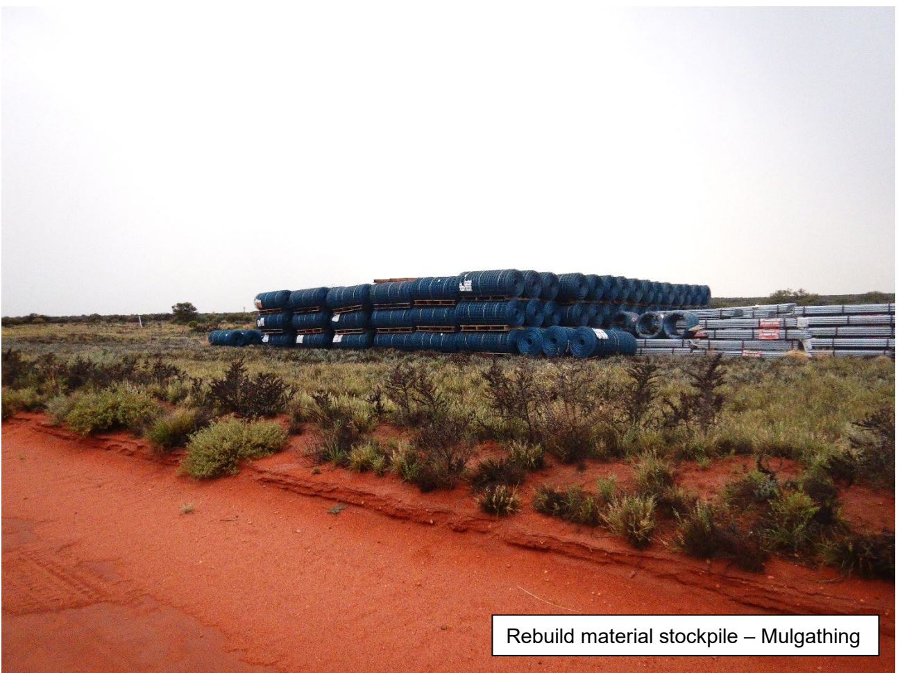
Rebuild material stockpile – Mulgathing