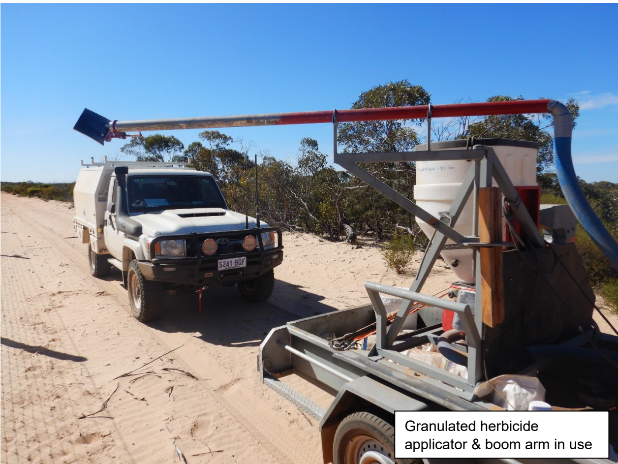
Granulated herbicide applicator & boom arm in use