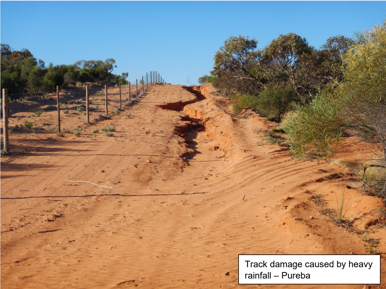
Track damage caused by heavy rainfall – Pureba